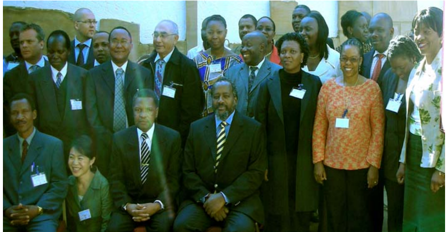
Participants during the training workshop

This was the first of a series of three workshops organized for African states. The meeting specifically targeted States that are non parties to the 2003 Convention, focusing on Central, Southern and West Africa, with the aim of introducing the Convention to cultural