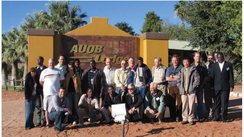
Participants during the workshop

UNESCO Windhoek initiated the network of Internationally Shared Aquifer Resources Management (ISARM) within SADC (March 2006) and organized the third regional ISARM-SADC workshop from 21-24 April 2008, in Stampriet, Namibia. It is also in Stampriet that a baseline study will be conducted on the TransBoundary Aquifer (TBA) that is shared by Botswana, South Africa and Namibia. The knowledge gained from the study will be the foundation for further efforts that will lead to a sound management of the resource by the neighboring countries.