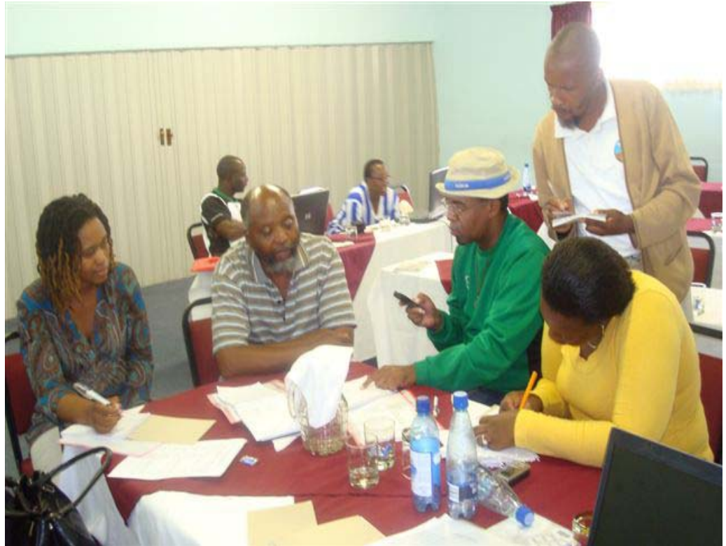
Reporters from the local media in Lesotho, discussing the draft poverty reporting guideline

The participants of the workshop were drawn from media organizations of the country including private radio stations, church radio stations, private news papers, individual journalists and free