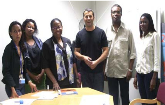
Windhoek Office Programme officers with Director