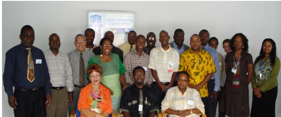
UNESCO Windhoek Cluster team ( Office and National Commissions from all five countries) during the Cluster Consultation which was followed by the Office Retreat

After ice breakers and the singing of the Cluster Office Anthem, the retreat started with group and individual needs assessments that inspired the discussion sessions on the last day. Topics that were handled were: Funding and Contracts; How the Office can reduce the workload without losing impact; the C-ports were revisited and C-ports specific behaviors were identified.