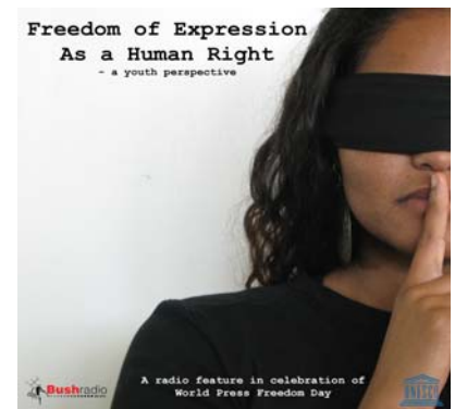
A cover of the CD produced to be disseminated to schools and community centres

was produced from the event. The documentary will be shared with other ASPNet schools as well as community radio stations within the Windhoek Cluster member states in the next few months.